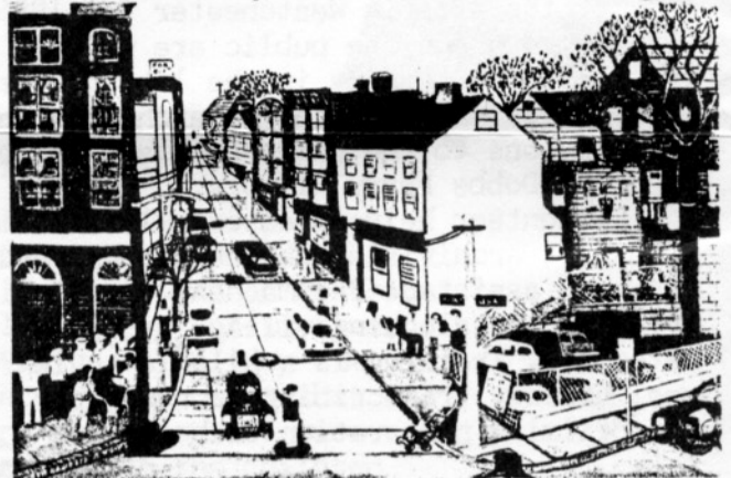
"Main Street-USA" by Ralph Fasanella